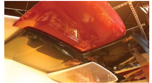
Car hoods are used to form a decorative ceiling over the front counter.

Waste reduction starts with good purchasing practices. The Bread Workshop buys only recyclable beverage and condiment containers, which helps keep non-recyclable waste to a minimum. To-go containers are compostable: Clamshells are made from sugarcane slash, the residue left over from harvesting sugar cane, and soup cups from waxed paper. The café serves shade-grown and fair-trade coffee, free-range chicken, and produce from organic and transitional farms.