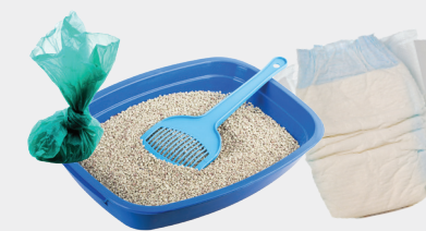
Diapers and Pet Waste