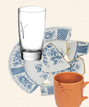
Dishware & Drinking Glasses