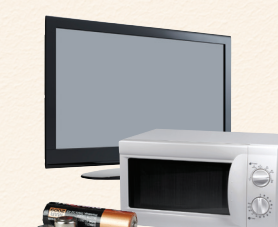
Hazardous Materials and E-Waste