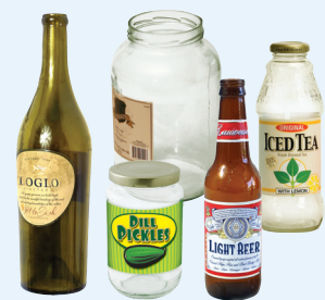
Empty Glass Bottles and Jars