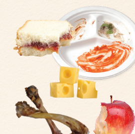
Food/ Green Waste