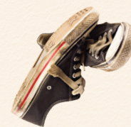
Clothing and Textiles