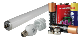
Fluorescent Bulbs and Batteries

Visit StopWaste.org/HHW or call (800) 606-6606 for more details and hours of operation.