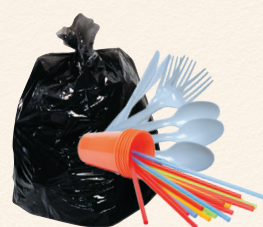
Plastic Bags & Utensils