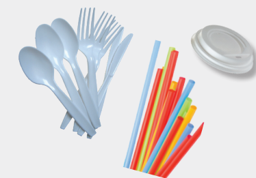
Plastic Utensils, Lids, Cups and Straws