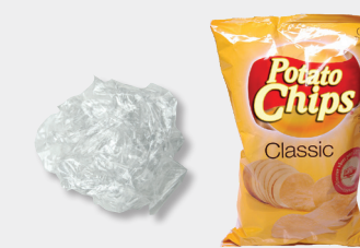
Plastic Bags and Wraps