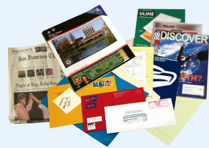
Clean Dry Paper