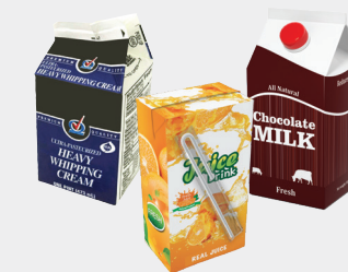
Drink Cartons and Beverage Boxes