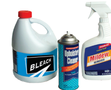
Household Cleaners and Chemicals