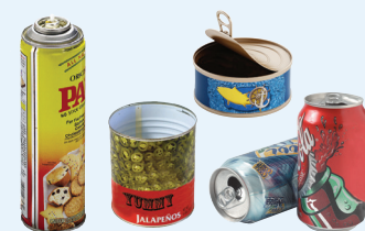
Empty Aerosol and Metal Cans