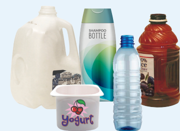
Empty Plastic Bottles and Containers