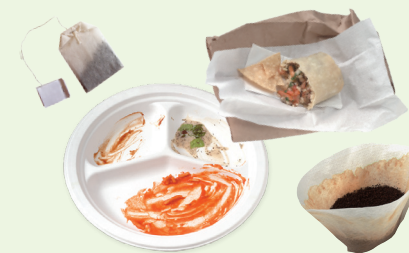
Food Soiled Paper

Uncoated paper plates & cups, pizza boxes, tea bags, coffee filters & grounds. No plastic-lined paper products.