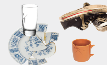
Miscellaneous Household Waste