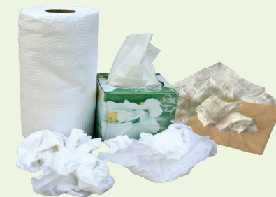
Paper Napkins and Paper Towels

Leaves, grass clippings, branches under 6" in diameter & untreated wood