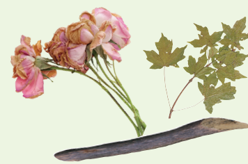
Plant Debris, Flowers and Untreated Wood

Uncoated paper plates & cups, pizza boxes, tea bags, coffee filters & grounds. No plastic-lined paper products.