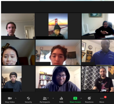
Oakland & San Leandro SWAP Youth Leaders