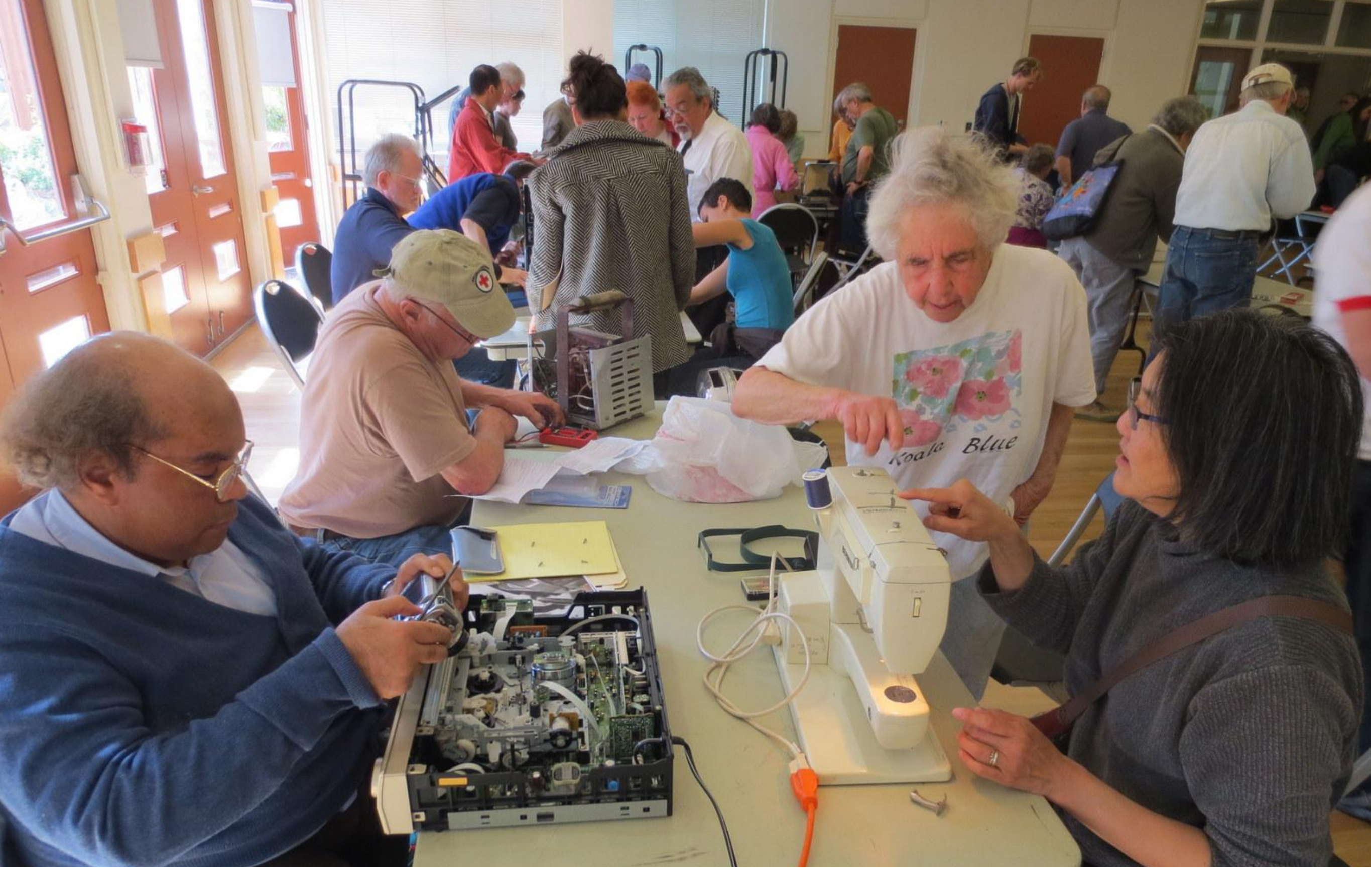
"Making something last a long time and reducing the need for replacement is an core environmental value."