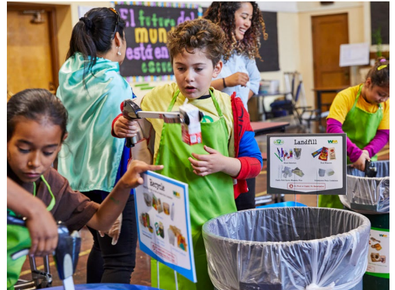
StopWaste works with school Green Teams to help their classmates sort properly at lunch.

Stakeholders, including district sustainability coordinators, teachers, and parents, are provided ongoing environmental education and technical assistance.