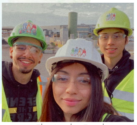
The Aguilar Family

Saturday, April 17, 2021 10:00am - 2:00pm Online Via Zoom