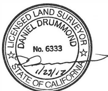
EXHIBIT "B" ATTACHED HERE TO AND MADE A PART HEREOF.