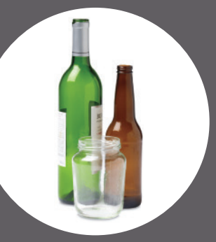
Glass bottles & jars

Contaminants can ruin an entire load of recyclables