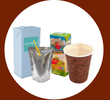
Drink & food cartons. boxes / pouches, lined paper products

Eliminate single-use plastic by using reusable bags and containers