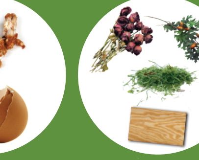
Bones & shells