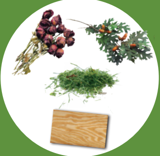
Plant debris & clean wood