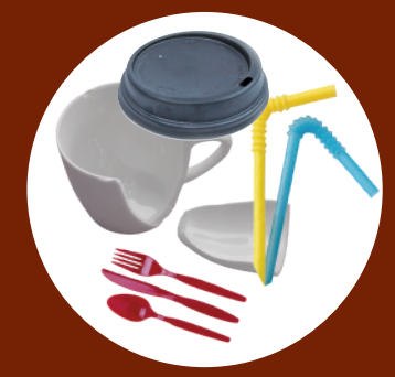
Broken glassware & ceramics, plastic straws, lids & utensils (Reusable items should be donated)