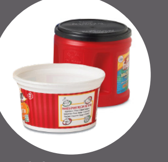
Rigid plastic containers Coffee grounds & tea bags