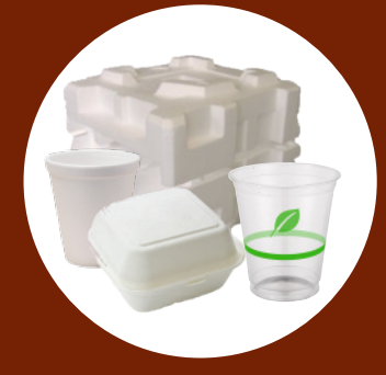
Polystyrene foam, plastics labeled "compostable"