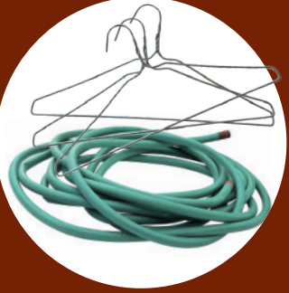
Hoses & wires