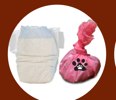
Diapers & pet waste