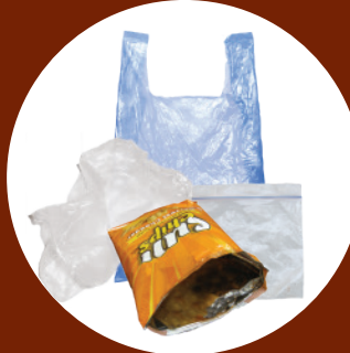
Loose plastic bags & wrap, snack bags