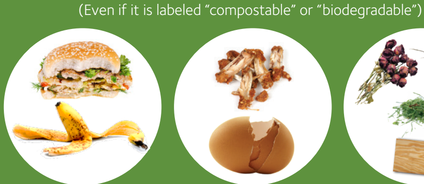
All food waste, peels, pits, & cores