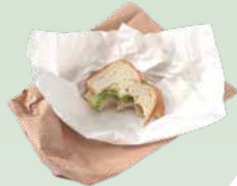
No plastic-coated paper