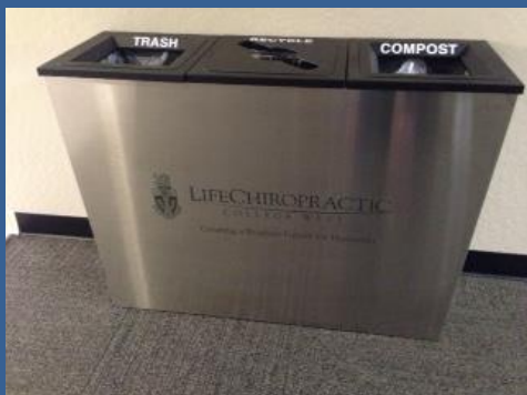
One of the many multi-stream waste bin sets at the Life Chiropractic College West campus.