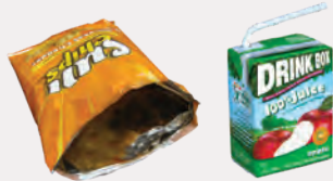
Food Wrappers, Juice Pouches & Boxes