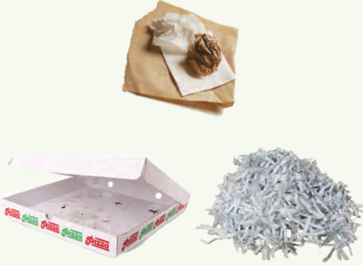
Food-soiled & Shredded Paper