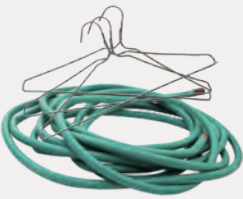
Hoses & Wires