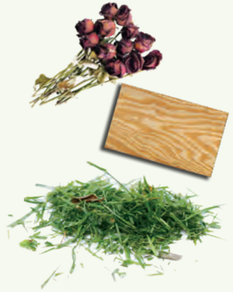
Plant Debris & Clean Wood