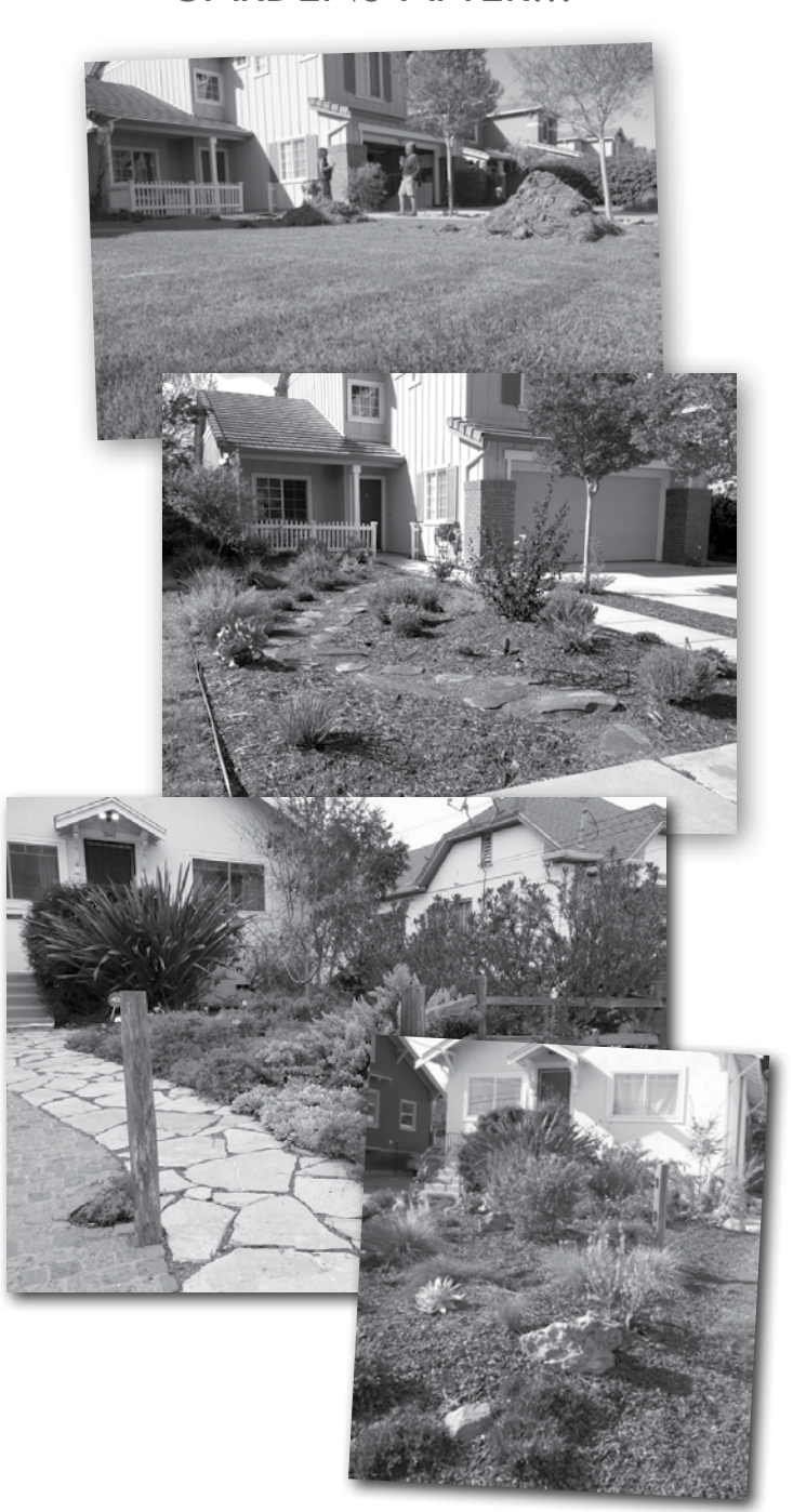
Visit www.lawntogarden.org for more information.