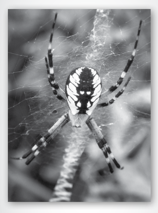
Know your bugs. The majority of bugs in the garden, like this spider, are beneficial.

Least-toxic chemical controls should be used as a last effort. Look for low-toxicity products that break down quickly, and purchase in small quantities so that you can avoid generating hazardous waste. A few least-toxic chemical controls available include: insecticidal soaps, horticultural oils, minerals, and botanicals (plant-derived insecticides).