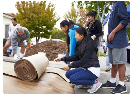
Many hands make light work so enlist some friends for your sheet mulch project.

Visit LawnToGarden.org for more information on using sheet mulch to transform your landscape.