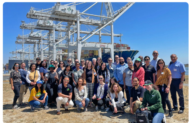
Recycling Markets Network participants tour the Port of Oakland, where recyclable materials such as paper are exported to overseas markets.